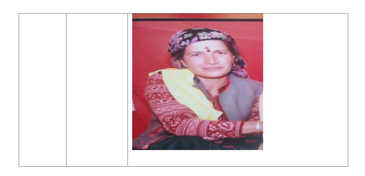
Prepared by : SHG members in consultation with DMU Theog, FTU Theog Forest Range and JICA staff.